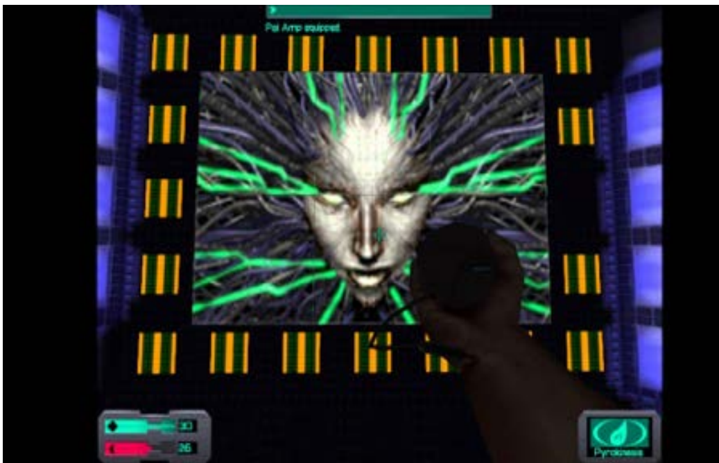
Figure 2. Meeting SHODAN in System Shock 2 (Irrational Games/Looking Glass, 1999)

As a product of the late nineties, the cyberpunk aesthetic of System Shock 2 represents a late, matured vision of the movement which skillfully integrates some of this movement’s most important traits. Hackers, AI, high-tech bioengineering, an ostensible ambiguity regarding the material body as a necessary yet obsolete device made of flesh (Cavallaro,