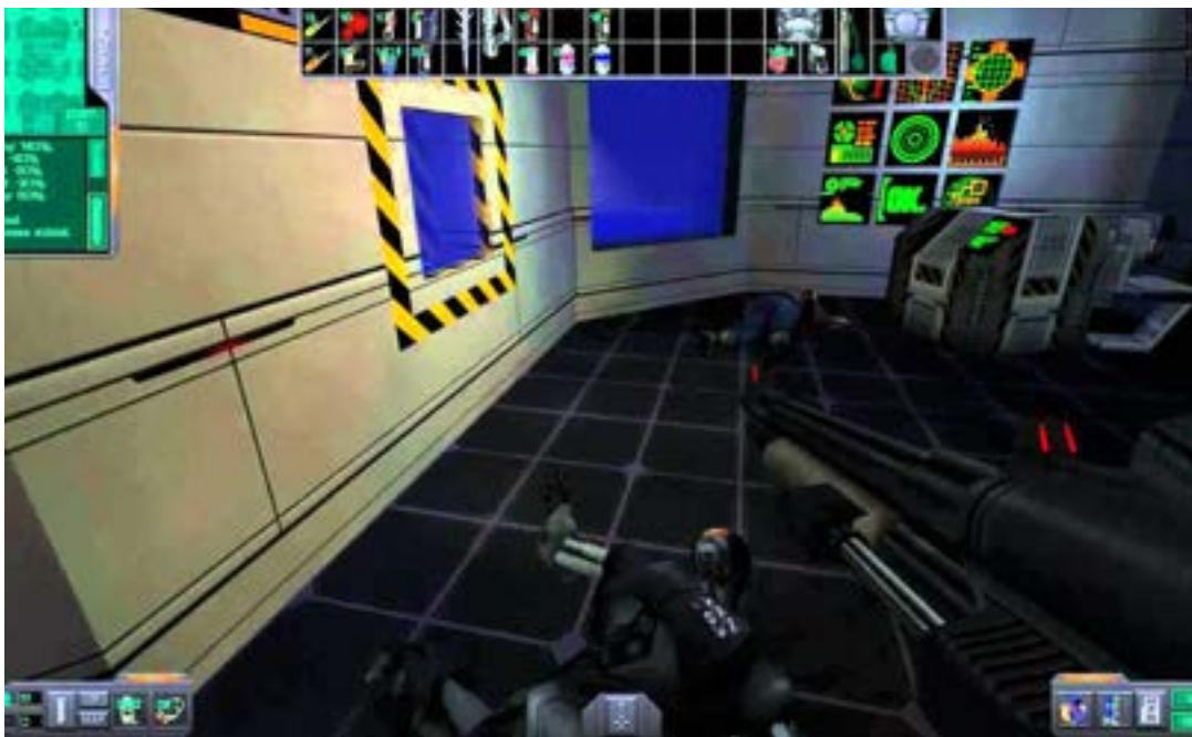
Figure 1. Gameplay screen of System Shock 2 (Irrational Games/ Looking Glass, 1999)

It is easy to recognize in System Shock 2 many of the tropes that made cyberpunk the most