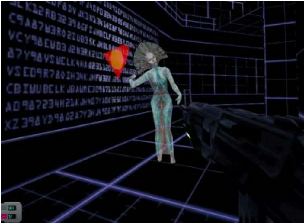
Figure 4. Human impersonation of SHODAN in the hybrid space (Irrational Games/ Looking Glass, 1999)

Eventually, we will get to the room where the malevolent AI awaits, visually represented by the figure of a female-like deity. It is possible to win this battle either through the use of brute force and weapons or by hacking four terminals spread around the room. System Shock 2 's cyberspace is peculiar for different reasons. It portrays one of the latest representations of this digital realm, and contains ideas inspired by various cyberpunk novels and movies like some of the mentioned above. This dimension is an offshoot of original cyberspaces because it fuses the material universe with the immaterial worlds of AI's dream and electronic pulses. The most remarkable contribution of System Shock 2 (and also of the original System Shock ) to the aesthetics of cyberspace lies in the manner with which it presents this digital environment in the form of a videogame and enables the player to experience it interactively. As Santos has affirmed, the plasticity of digital creatio-